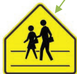
School Zone Crossing (Two People)