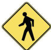
Pedestrian Crossing (Single Person)

Indicates marked or unmarked pedestrian crossing